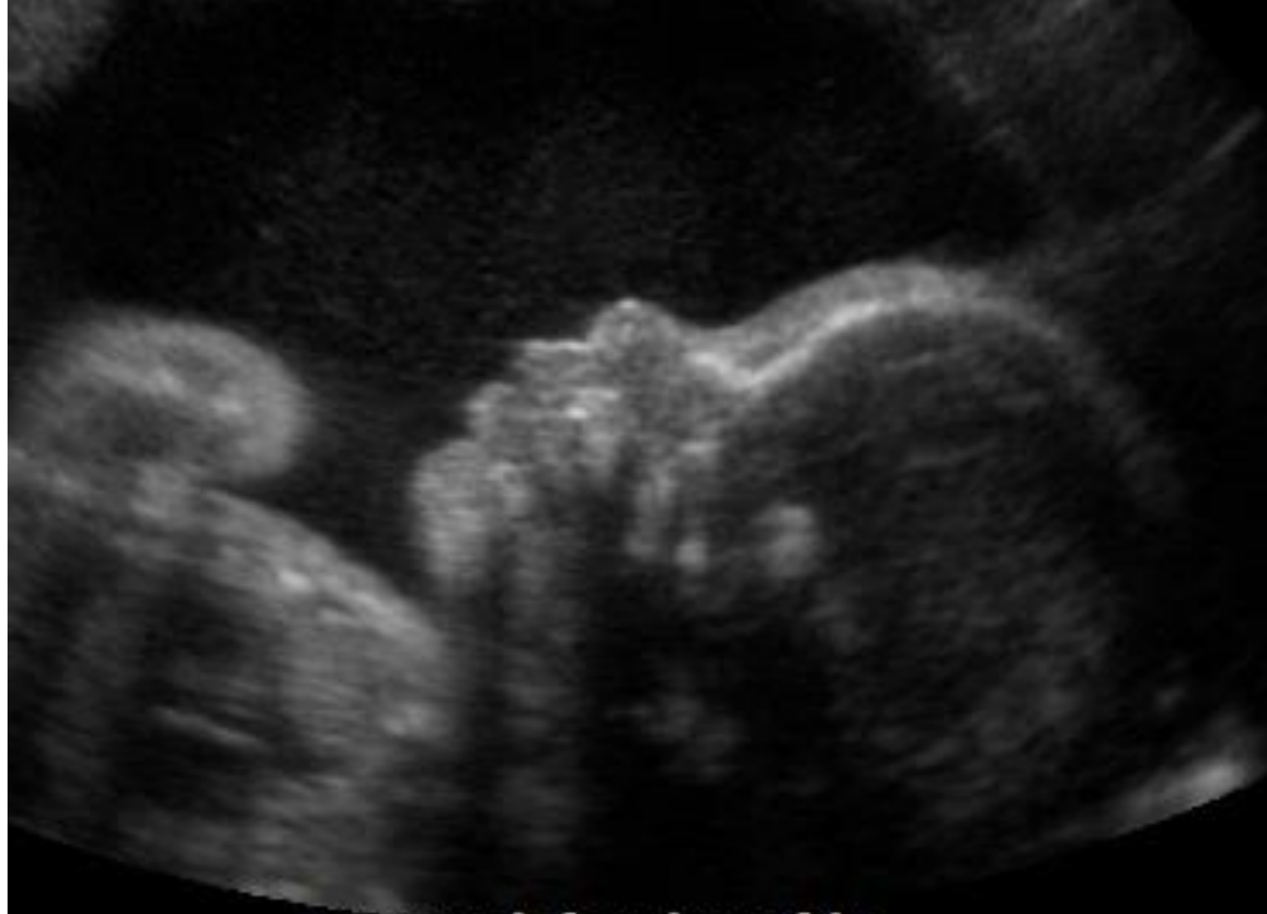
20 week fetal profile